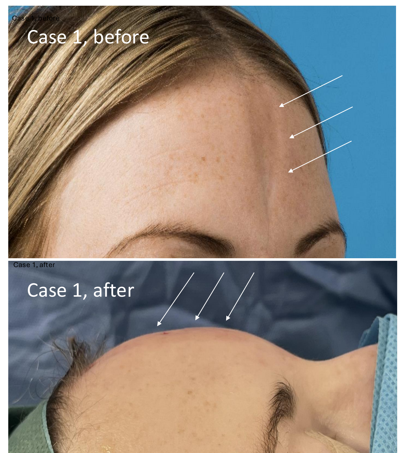
Before and after images following two fat grafting sessions and two hydroxyapatite injection treatments

Case 1 is a 30-year-old female with linear circumscribed scleroderma of the forehead, maintaining a steady state after local corticosteroid treatment. Case 2 is a 40-year-old female with cutaneous limited systemic sclerosis primarily affecting the periorbital region and causing severe atrophy of the lower third of the face. She is undergoing medication-based immunosuppressive maintenance therapy with monthly infusions of tocilizumab, a monoclonal antibody (biological).